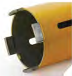
CB D ARIX-SH

For drilling various ranges of materials; from heavily reinforced concrete to asphalt, the ARIX Wet Core Bits will ensure maximum performance and satisfaction to each and every customer.